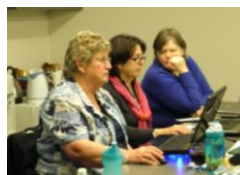
(Taken 2012 slc2nz)

PS. Sunday afternoon I received a text from Jan Gow booking the weekend ending 27 th September 2015 for the next Salt Lake City to New Zealand in Northland . Make a note in your diaries and more details will follow.